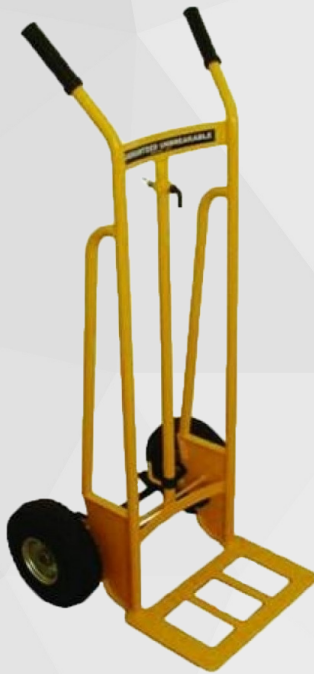
TH300 ALL ROUNDER