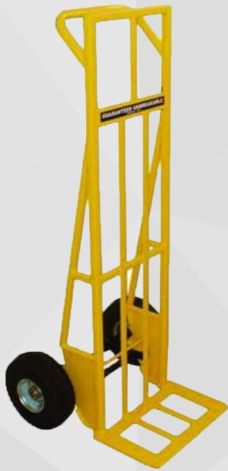
SF300 BOX 'N' BAG