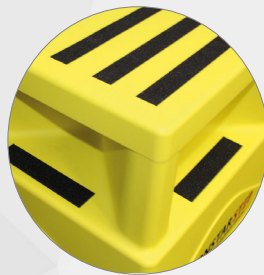
Four Way Access